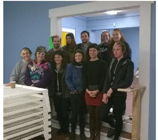
The original staff that opened the Overnight Shelter in November 2014

It was an historic turning point in the development of homeless services in our community, but there was precious little time to dwell on the Big Picture –the everyday needs of the shelter and guests demanded tremendous energy and flexibility from our managers, support staff, volunteers, and the guests too. The creativity and resilience of our shelter staff is the big untold story of this project, and this community owes them more than can ever be paid.