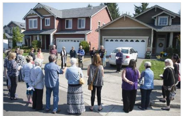
Neighbors and friends of a homicide victim gathered at a Moment of Blessing southeast of Lacey in September 2017.

http://interfaith-works.org/about-iw/programs-projects/moments-of-blessing/