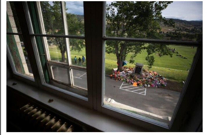
A makeshift memorial to honor the 215 children whose remains have been discovered near the Kamloops Indian Residential School in British Columbia, earlier this month.

That school is in Kamloops, a city in <u>British Columbia</u> from which, 52 years ago, Indigenous leaders started a global campaign to reverse centuries of colonial eradication and reclaim their status as sovereign nations.