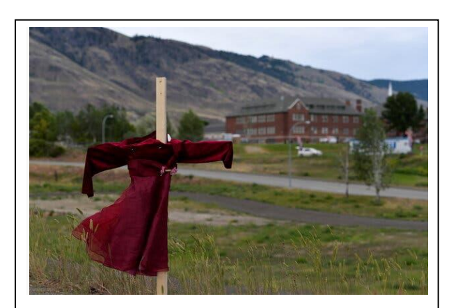
Near the grounds of the former Kamloops Indian Residential School.

Mr. Trudeau <u>promised</u> to pass a similar law nationally in 2015, but faced objections from energy and resource industries that it would allow Indigenous communities to block projects. He continued trying, and Wednesday's passage in Parliament all but ensures that Canada will fully adopt the U.N. terms.