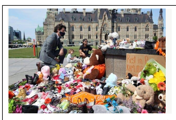
Prime Minister Justin Trudeau visited a makeshift memorial near Canada's Parliament honoring the children whose remains were found near the school in Kamloops.

A <u>sweeping 1996 report</u>, chronicling many of Canada's darkest moments, was followed by a second investigation, <u>focused on residential schools</u>. Completed 19 years after the first, the <u>Truth and Reconciliation Commission</u> spurred yet more federal policy recommendations and activism, including last month's discovery at Kamloops.